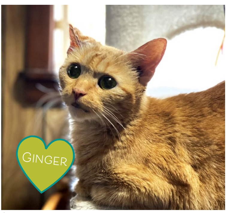
↑ Ginger is a sweet 11-year-old who was diagnosed with thyroid disease. Luckily, she improved greatly with medication and was lucky enough to find an amazing forever home where she is living her best life!

for our foster cats. We take in cats with a wide range of medical issues, ranging from simple upper respiratory infections and parasites to serious illnesses and injuries, including conditions requiring major surgeries. In 2020, our volunteer foster parents incurred more than $45,000 in out-of-pocket vet bills, and this grant (and other donations) help us reimburse our foster parents a portion of those expenses. If you want your donation to specifically benefit our medical fund, just note "Med Fund" on your check or PayPal form!