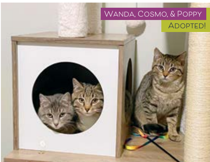
WANDA, COSMO, & POPPY ADOPTED!