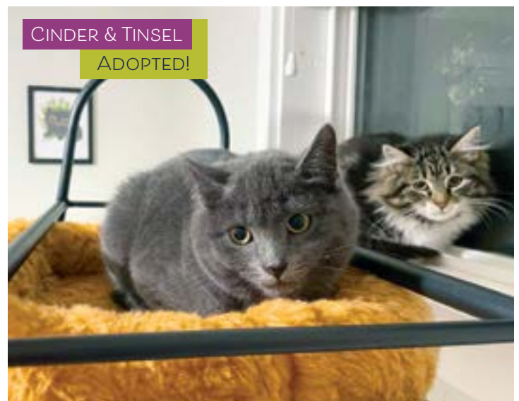
CINDER & TINSEL ADOPTED!