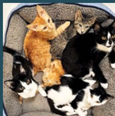
Kittens from a large hoarding situation