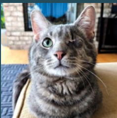
Hamlin—needed surgery for ruptured left eye

These cats and hundreds more were rescued and adopted through the Cat Coalition this year thanks to support like yours.